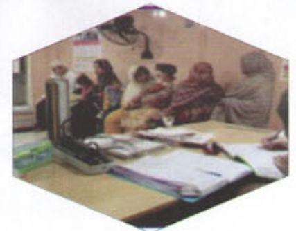
3.OPD Pindi Centre