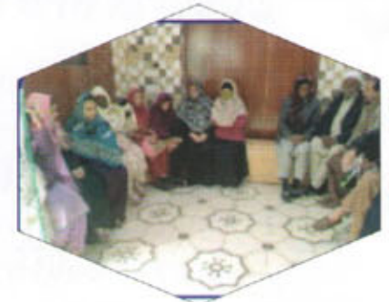
4.OPD – Lahore Cantt Centre