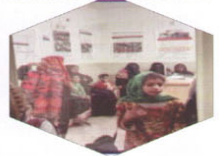
2.OPD – Karachi Centre