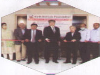
Japan Counsel General inaugurating Karachi Centre